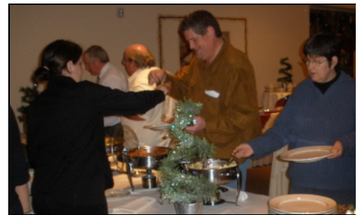
Dinner is served and enjoyed!

For additional information, contact your local president or representative who will provide you with the necessary information.