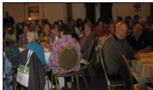
Below: Members enjoying the session.